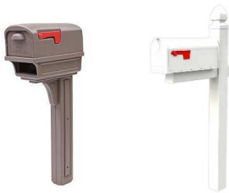
Permitted Mailbox Styles

Mail Boxes - All mailboxes in Rainberry Villas must conform in size and shape (look around the neighborhood at others), and must be a single solid color - white, brown or beige. The style must be that of a simple, standard rural mailbox (no oversize package boxes), and shape must be the typical simple container with a door on the street side and a flag. The mailbox must be mounted on a 4x4 pressure-treated wood post. Decorative boxes or boxes depicting animals, birds or other shapes are not permitted . If the homeowner intends to replace the mailbox, they must submit a Property Alteration Request including a clear picture of the proposed new mailbox to the Architectural Committee before purchasing the new box.